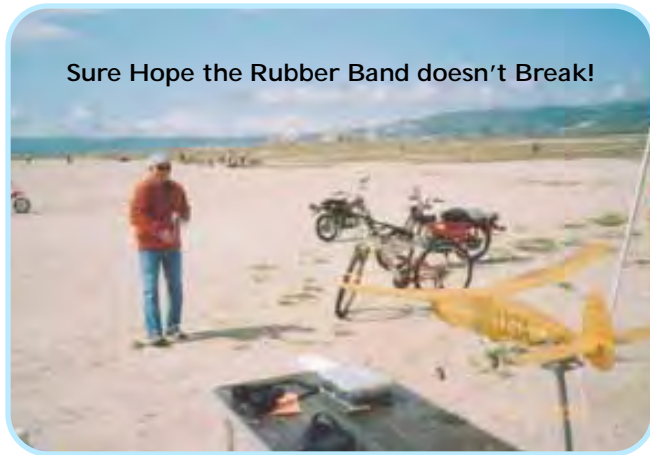
Sure Hope the Rubber Band doesn't Break!