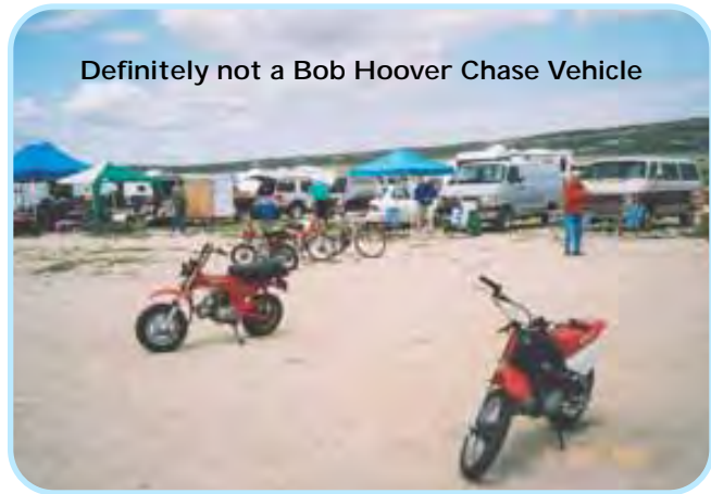
Definitely not a Bob Hoover Chase Vehicle