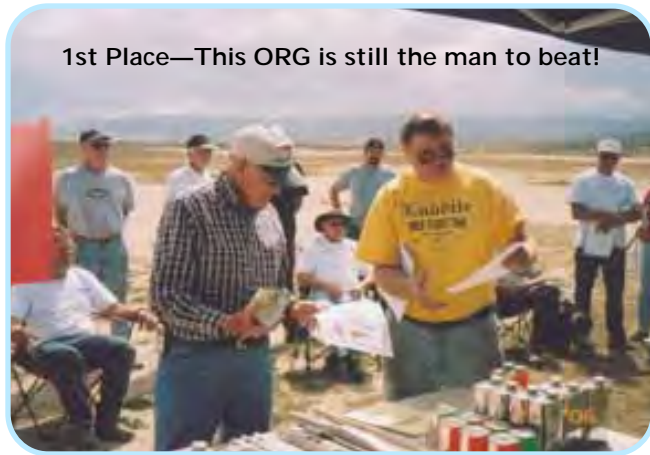
1st Place—This ORG is still the man to beat!