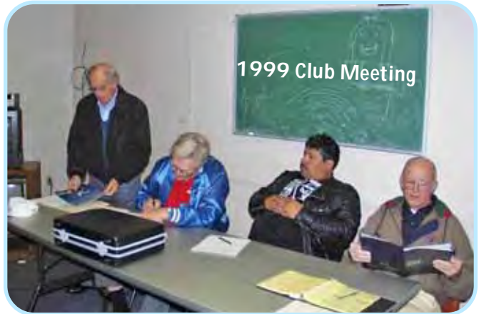
1999 Club Meeting