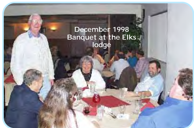
December 1998 Banquet at the Elks lodge