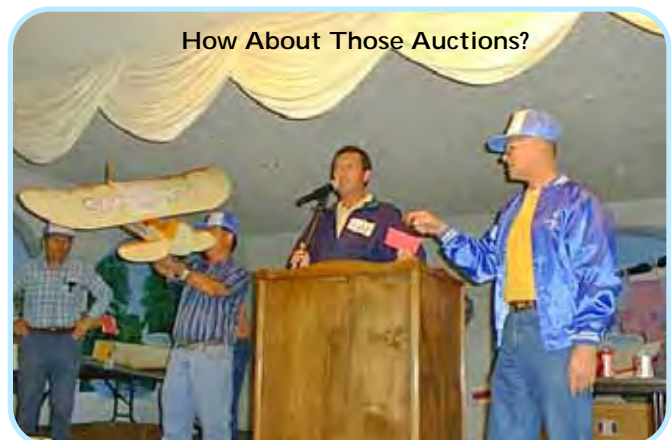
How About Those Auctions?